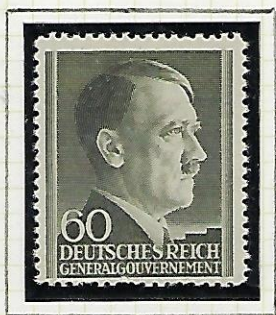
60 Gr deep olive