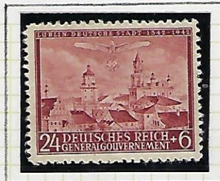
24 + 6 Gr brown carmine: "View of Lublin", contemporary work with text: "Tipus civitatis Lublinensi in Regno Poloniae".