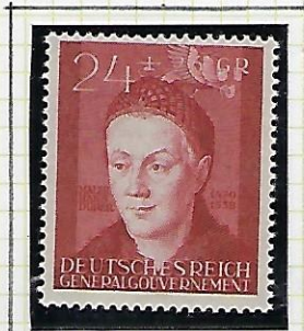
24 + 26 Gr brown-car-mine: Hans Dürer (1490-1534), the German painter.