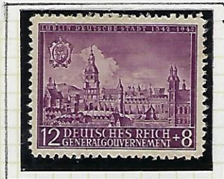
12 + 8 Gr deep violet: "View of Lublin", part of copper engraving by Abraham Hogenberg (? - abt.1653) in "Civitates orbis terrarum" (1618) by Georg Braun.

15 Aug. 1942: 600th Anniversary of the Foundation of Lublin. Four stamps, designed by artists of the Govt. Printing Works, Vienna, which printed them photogravure on medium, white paper. No watermark. Perf. 12½. Sheets in 2 panes of 5 x 10 stamps each.