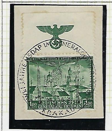
1 Zl + 1 Zl deep green.