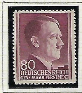
80 Gr deep lilac