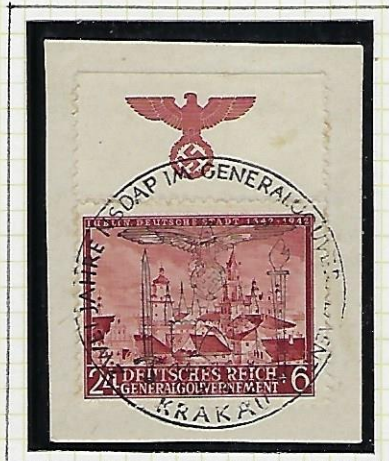
24 + 6 Gr brown carmine.