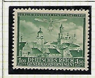
1 Zl + 1 Zl deep green: As before; see under 24 + 6 Gr stamp.