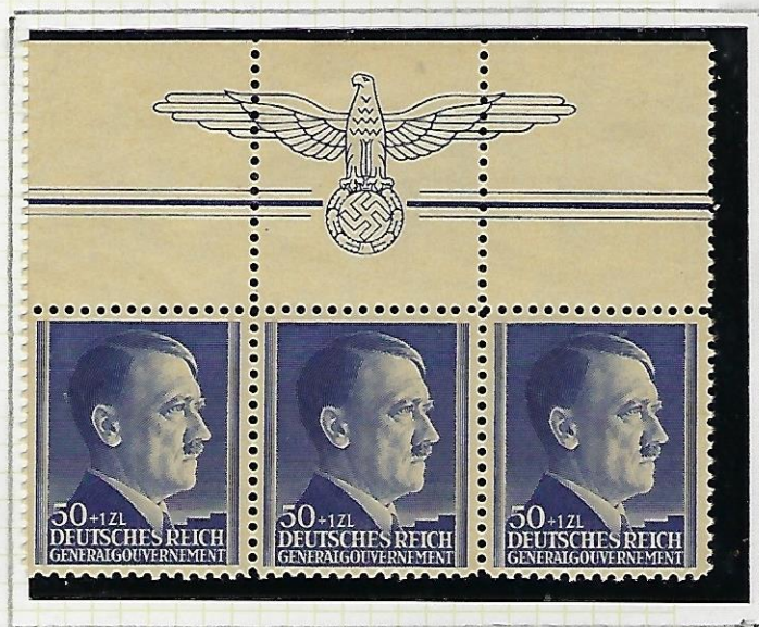
50 Gr + 1 Zl: dark violet-blue.