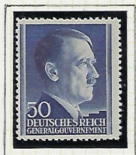
50 Gr deep blue-violet

7 April, 1942: Portrait of Hitler with Recessed Background. Six stamps designed by W.Dachauer and engraved by F.Lorber. Printed recess by the Govt. Printing Works in Vienna, on medium, white paper. Gum smooth or vertically speckled. No watermark. Perf. 12\frac{1}{2} . Sheets in 4 panes of 10 x 5 stamps each.