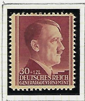
30 Gr + 1 Zl brownish carmine.

20 April, 1942; Hitler's 53rd Birthday. Three stamps designed by W.Dachauer and engraved by F.Lorber. Printed copper-plate by the Govt. Printing Works, Vienna on thick, cream-coloured carton-like paper. No watermark. Perf. 10\frac{3}{4} . Issued in decorated sheets of 5 x 5 stamps (see following pages).