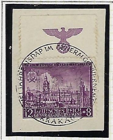
12 + 8 Gr deep violet.

As above; cancelled with special postmark "2 Years NSDAP in the Gen.Gouv. - Cracow" .