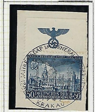
50 + 50 Gr deep blue.