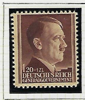
1.20 + 1 Zl dark bistre-brown.