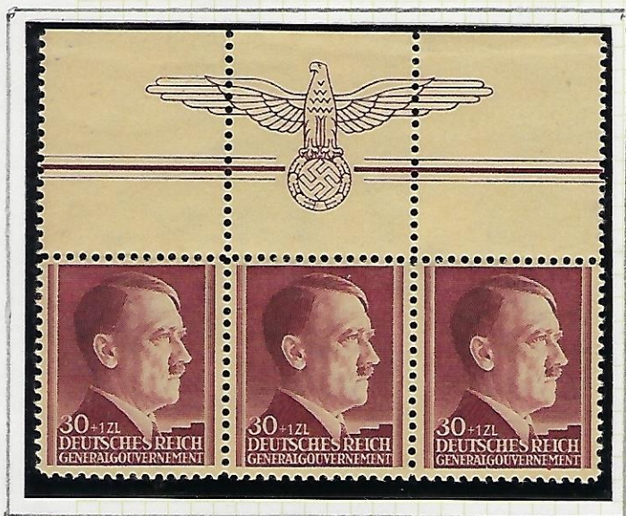
30 Gr + 1 Zl: brownish carmine.

The stamps with the German Swastika Eagle over the centre of the sheet: