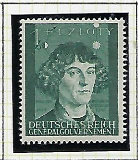
1 Zl + 1 Zl black-green: Mikołaj Kopernik (Copernicus), the famous Polish astronomer.

This deceitful mix of Germans and Poles seeks to portray all as Germans. After all, the Nazi Government-General was trying hard to destroy Polish culture and promote German "cultural superiority" everywhere in Poland.