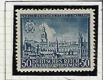
50 + 50 Gr deep blue: As before; see under 12 + 8 Gr