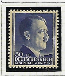
50 Gr + 1 Zl dark violet-blue.