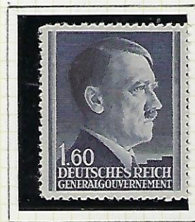
1.60 Zl blackish grey-violet