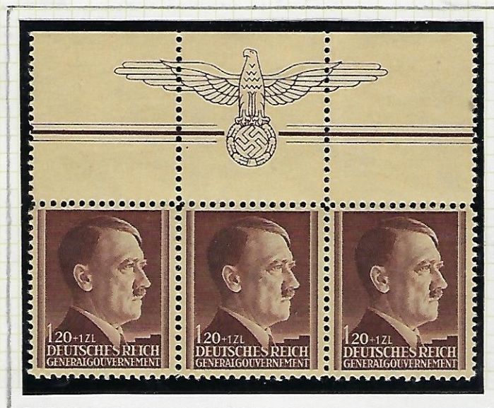
1.20 + 1 Zl: dark bistre-brown.