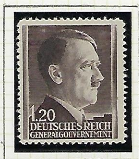
1.20 Zl dark violet-brown