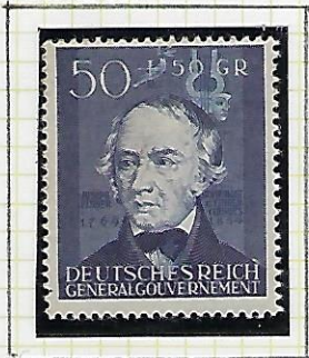
50 + 50 Gr black-violet: Józef Elsner (1769-1854), composer and teacher of Fryderyk Chopin.