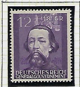
12 + 18Gr grey-violet: Wit Stwosz (+ 1447-1533) the wood sculptor who made the St.Mary's Church altar in Cracow.