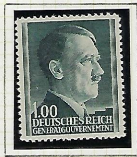
1 Zl greyish green